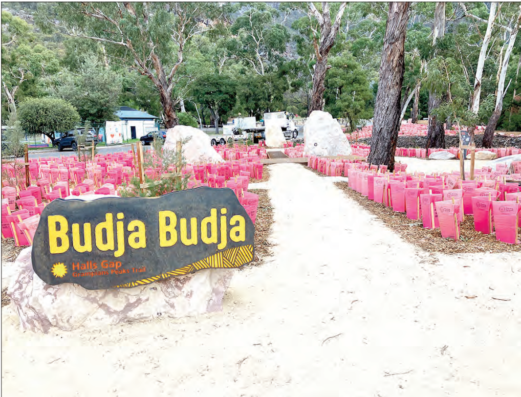
• Better access to walks supports Grampians recovery. View of Budja Budja trailhead.