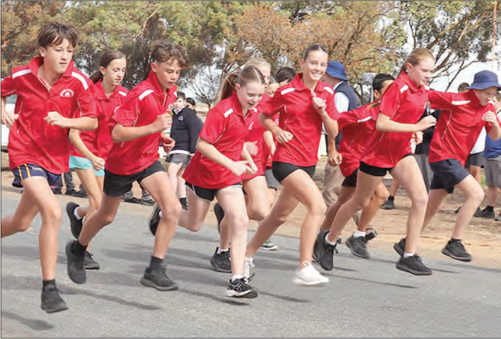
• Group photo of Senior School Cross Country runners 12-13 Division.

students who acted as guides for the younger students. The senior students role modelled the values of resilience and aiming high; assisting their younger peers to run as well as they could, and to complete the challenge.