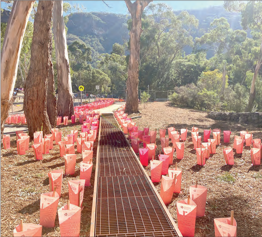
• Better access to walks supports Grampians recovery. View of Budja Budja trailhead.