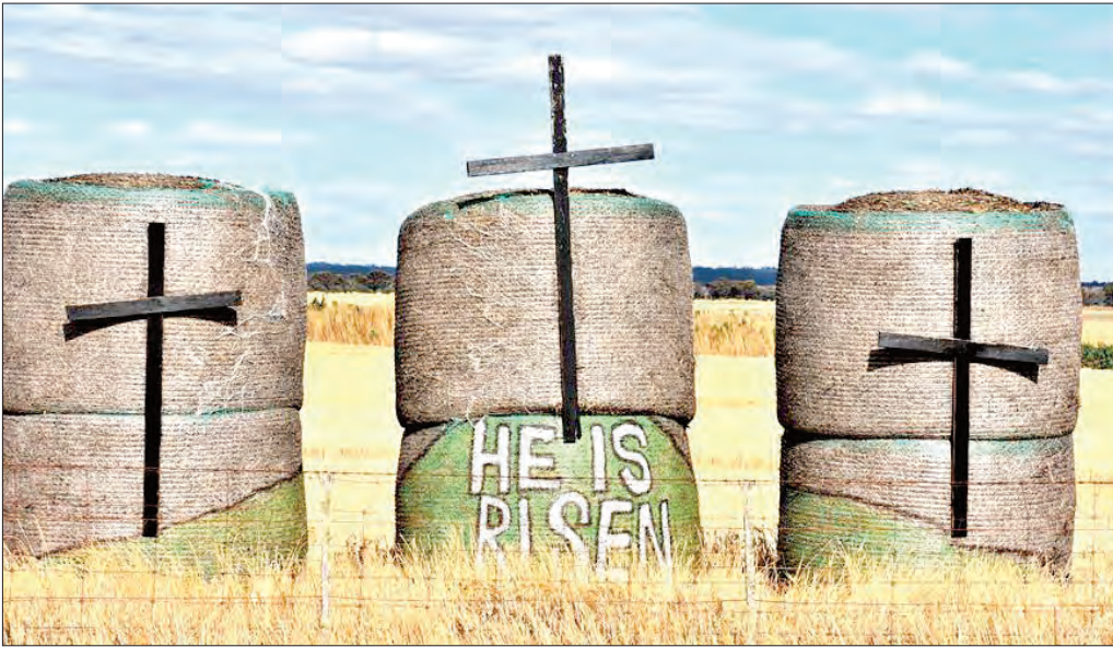
• A local farmer constructed this eye catching reminder of the centrality of the cross in the atoning work of Jesus. His blood was shed for us on that cross, He died and was buried and rose again.