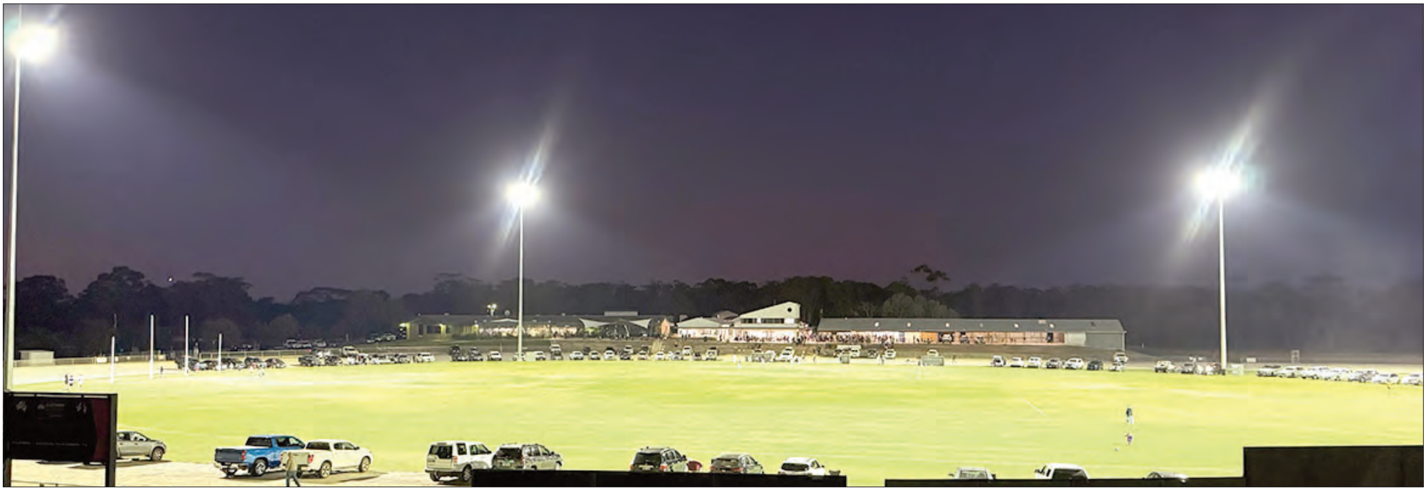
• Looking towards changerooms.