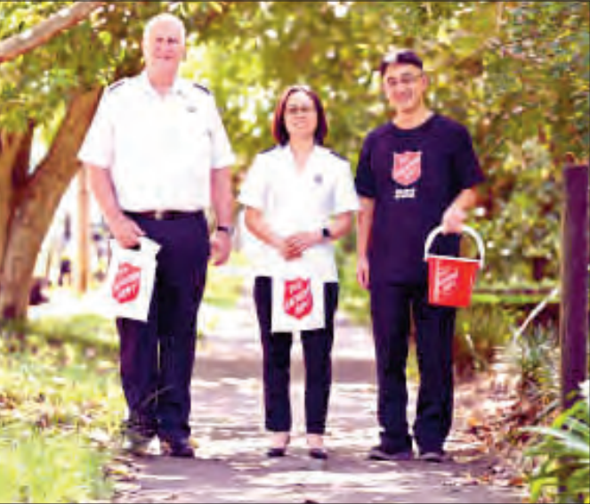
• Support the Salvation Army’s Red Shield Appeal.

To donate or volunteer for The Salvation Army’s Red Shield Appeal or if you need support from the Salvos, visit salvationarmy.org.au or call 13 SALVOS. You can also donate at any Salvos Store.